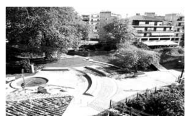
Figure 3: Agia-Varvara, Drama. A new natural and cultural identity for the city.

All these examples referring at the same time to social, ecological and perceptual parameters, read in each case the inner capacity of the landscape to be designed, promoted and enhanced as a contemporary and cultural one. The topography, the hydrology, the vegetation, the existing ecosystems, the human trace in the space, the spatial characteristics, the special architectural qualities are used to reconstitute a new landscape physiognomy, respecting the existing resources, revealing the inner potentials and describing a new vision, a new scenario of progress, to form a sustainability perspective,. Landscape architecture projects, as artistic, scientific and society's projects, reveal the notion of well-being upper of the idea of sustain or just live, adding value to the city, enriching the urban space culturally and ecologically and formulating finally at the present the framework for a society to develop in the future. This is the landscape architecture overall conception of sustainability.