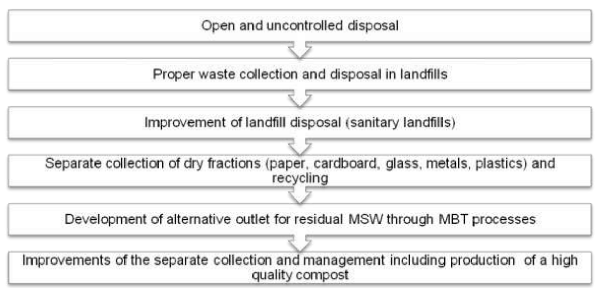
Figure 1: Steps and actions for integrated municipal solid waste management.

represents the steps that are usually enforced in order to improve a country's waste management system.