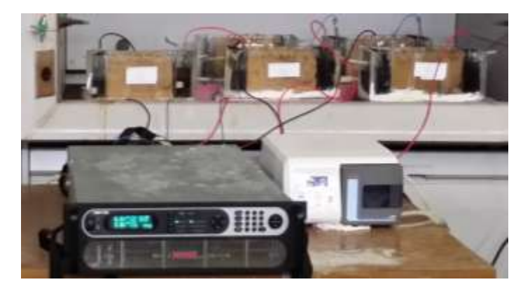
Figure 1: Pulsed Electrokinetic Set-up

The reactors used for the PEKR experiments were three compartments cell made up of Plexiglas, each having capacity of treating up to 2400 \text{cm}^3 of contaminated soil. The middle chamber was for the contaminated soil while the two (2) sides chambers were for the electrode and electrolytes. The experimental set-up is depicted in Figure 1 which consists of two graphite electrodes ( 12 \text{cm} \times 10 \text{cm} \times 0.5 \text{cm} each) serving as anode and cathode, a DC power supply (Sorensen SGI series), a pump (Thermo Scientific FH100) for refilling and replacing process fluids and data logger . 1N HNO<sub>3</sub> and 2N NaOH were used as the anolyte and catholyte, respectively.