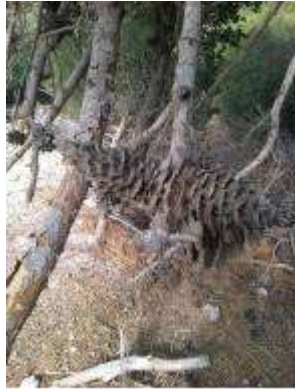
Figure 2: Bitten Pine cones in the tree

The 85% of the people we ask about the Persian squirrel, they didn't know that it's a unique species for Europe which we can see only in Lesbos. Very few know and even less people appreciate the value of this species which helps in the natural regeneration, in the contrary the local use to eat the squirrels or shoot them for fun, the people consider them as a pest.