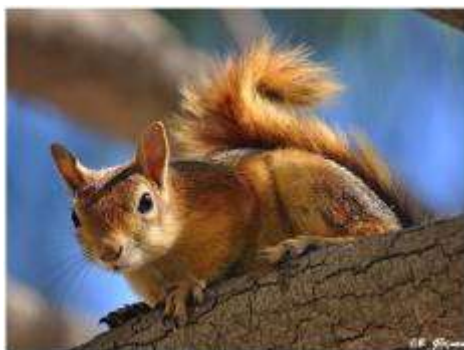
Figure 1: Persiann squirrel ( Sciurus anomalus )

In Greece the Persian squirrel can be found only in the east island of Aegean, Lesbos (Hecht Markou P., 1994). The Persian squirrel ( Sciurus anomalus ), has the smallest body size from all others species of its genus that are found in Europe. The head of the Persian squirrel, the front legs and the tail has a red- brown color and its back is grey- silver. The belly has a yellow- white color and the tip of the tail it's black. (Eustratios D. Valascos et al , 2012). The average body size for adult male persons is 40,5cm and for the females is 38,5cm.