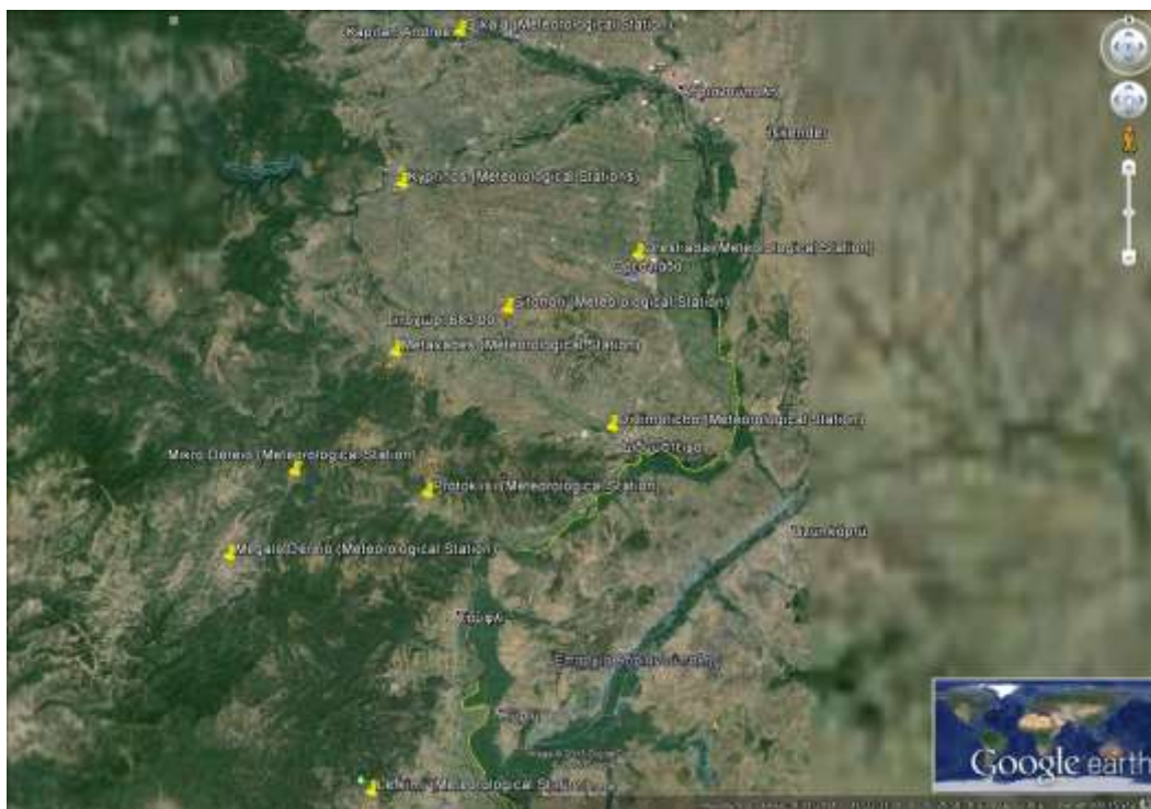
Figure 1: Location of rainfall stations (yellow pins) at Evros river basin, Evros Prefecture, Greece

Rainfall data at ten stations (Didimoticho, Dikaia, Kyprinos, Lefkimi, Megalo Dereio, Metaxades, Mikro Dereio, Orestiada, Protoklisi, Sitohori) for Evros river basin (Greek sector) are collected and used in this study. The locations of rainfall stations under study is shown in Figure 1.