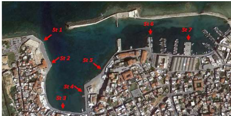
Figure 1: Map of the Venetian harbor, showing the 7 sampling locations.

throughout the period of February to October 2014, in order to obtain a more uniform (both in high- and low-touristic season) view of the water quality.