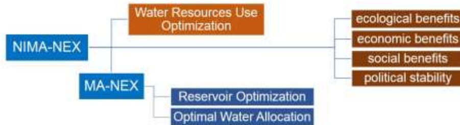
Figure 1: Aims and objectives of MA-NEX.

The NIMA-NEX project aims at optimizing the use of water resources within the Nile basin in terms of a nexus approach. For this purpose, the current study will develop a management tool, the so-called MA-NEX tool. The aims and objectives of MA-NEX are summarized in Figure 1 and described below.